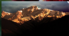
Way to Gods Own Lake (way to Deoriya Taal) by Abhishek Mandal